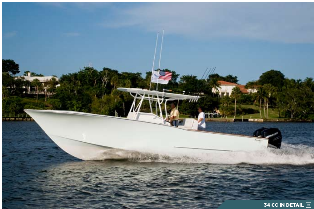
34 CC IN DETAIL

T hanks to a family owned and operated philosophy, Bonadeo Boatworks primary focus is the conception and manufacture of custom sport fish boats. The spectacular vessels this team unveils consist of composite designs combining nothing but the finest components. Each 34 CC is designed one at a time starting with conceptual ideas from the prospective owner, through finalization with the naval engineer, designer, and finally the builder. From this point, the technologically advanced manufacturing process begins. This is where the builder and intended owner customize the platform from a hands-on perspective, resulting in uncompromised attention to detail, the